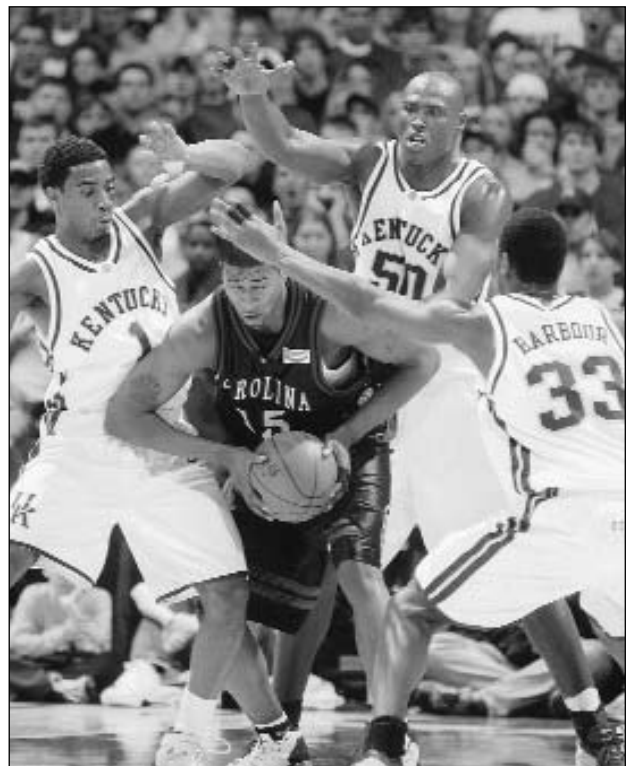
The Cats' 26-game win streak in 2003 ranks third in school history.